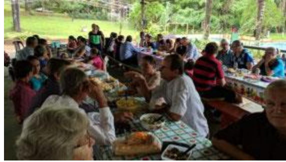
Social Day at the Shelter

In north-east Argentina lies the province of Misiones, whose name comes from the missionary work in Guaraní lands, made by the Jesuits between 1609 and the expulsion of these decreed by King Charles III Spain in 1767.